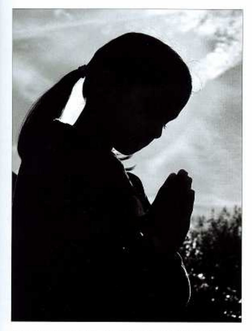
Greeting from Shishukunj members.